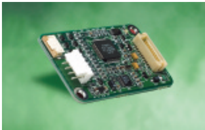
2216 combo controller board